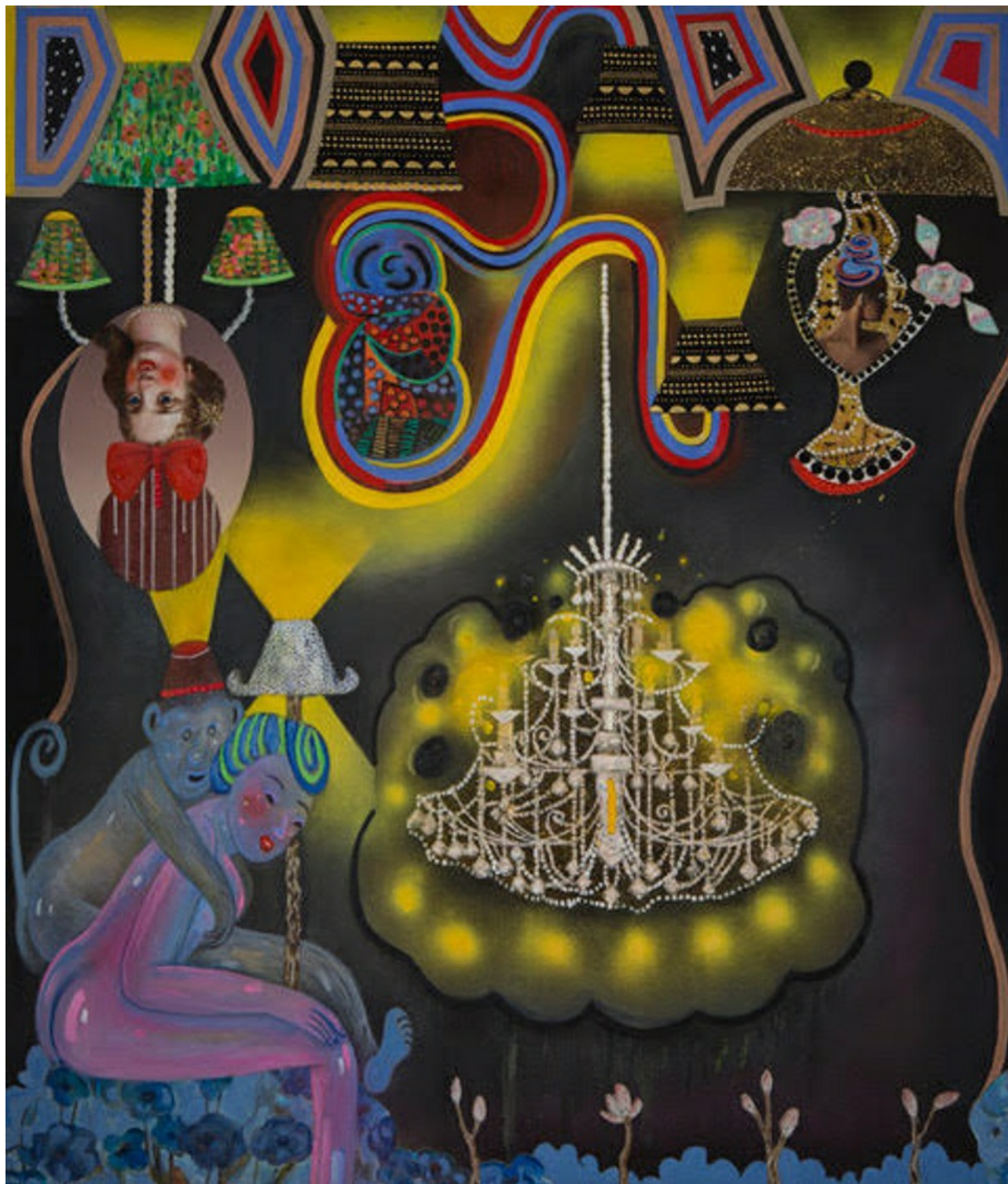
Glow, 60" x 70," mixed media, collage, oil on canvas, 2017.

It was very strange, but I think there's some way, if you've got an eye for things. Even in my studio, if I start to look around, I'll be surprised. "Wow. I didn't realize I was putting this against that because boy, they really work." You know what I mean? In my house, there are certain ways that I put things together, and I don't do it on purpose. But one day I'll look around and say, "Wow. Everything's got this same pattern on this end of the building." Then it changes to something else. It's a visual curation.