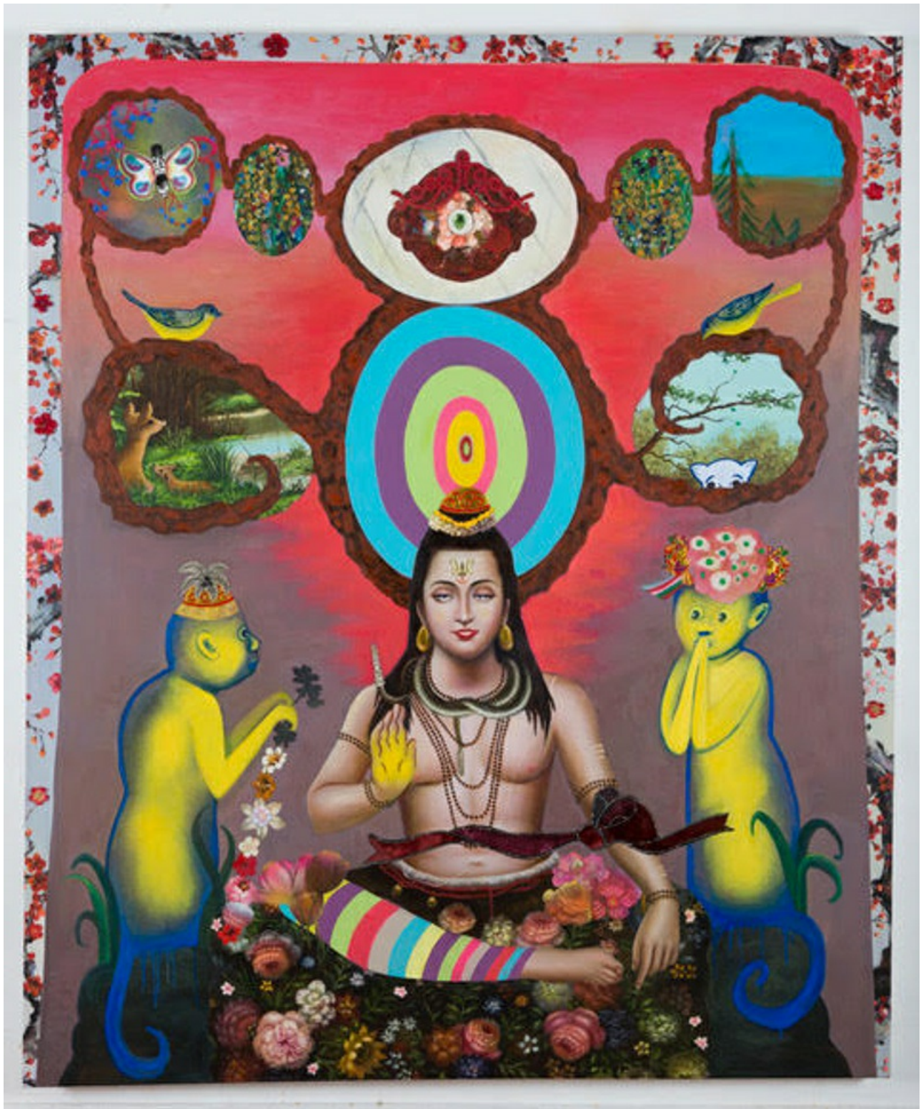
The Good Keeper of All Living Things , 70" x 60," mixed media, collage, oil on canvas, 2016.