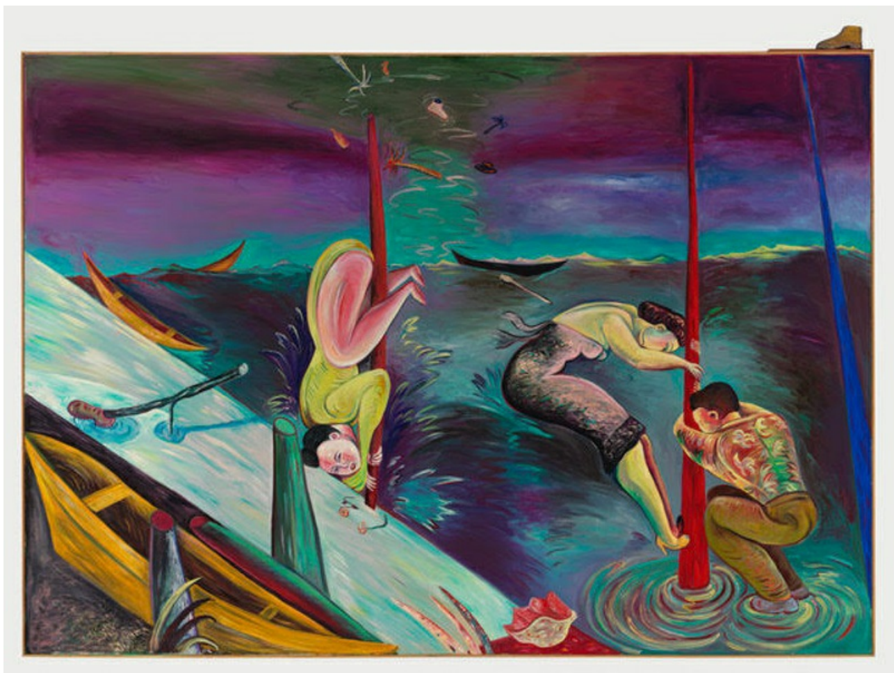
Shipwrecked, 72" x 96," oil on canvas, 1987. Collection of The Krannert Art Museum.

A curator came to my studio last week. I told her that there are some people who say my work is dirty, and that when I thought about it, I kind of got insulted because I think they thought I was thinking of pornography, which of course I'm not. We were talking about it, and she said, "You know, I think your work is dirty and dainty." I think if you're talking about dirty as being covert sexuality, and the daintiness in terms of how I present it, I think that's a very accurate way of talking about a lot of my work.