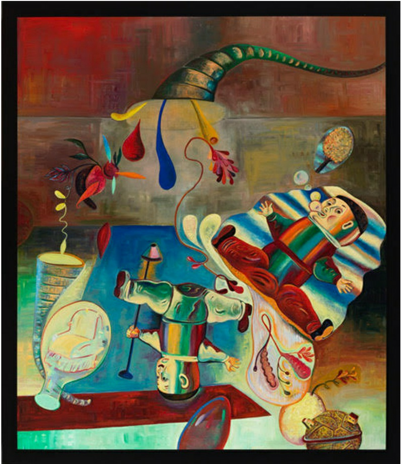
Decoys , 84" x 72," oil on canvas, 1989.

I read that your father, who sold automobile parts wholesale, decorated the house you grew up in with statues and pictures of nude forms, ranging from calendars to pens. The nude or semi-nude makes a frequent appearance in your work, as well as knickknacks, picture frames, and other signifiers of domestic space. Could you speak about some of your earliest visual memories as they relate to your work?